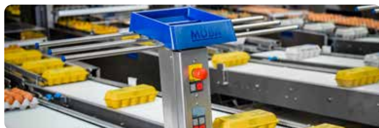
Consistent high-quality output while streamlining operations.

The Forta GT grading line represents a breakthrough in egg sorting, enhancing profitability with automation and quality control. Reducing manual labor, particularly in egg handling, it can save up to one full-time position. Integrated software tools further boost productivity and maximize egg value, enabling consistent high-quality output.