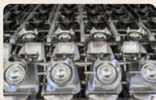
New Moba Proxima breaker for improved efficiency automation and hygiene.

Moba addresses the increasing need for advanced automation in the egg processing industry with its latest innovations. The Proxima egg-breaking and separating system sets a new benchmark for product quality and hygiene, while significantly reducing water and chemical consumption. Furthermore, the optimized and retrofittable Ohmic product heating method offers precise and cost-effective heating for extended production periods, without compromising the functional properties or shelf life of the final product. These advancements can significantly enhance egg processing and pasteurization operations through improved efficiency, automation, and hygiene.