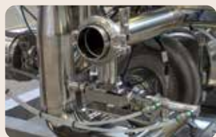
Moba Ohmic for precise optimized heating.